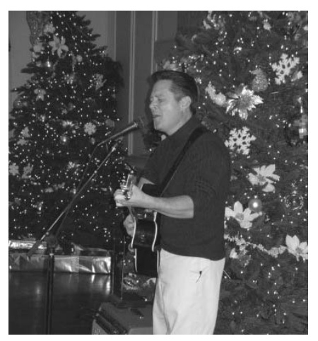
Entertainment & Sing-Along.