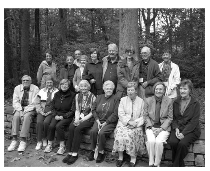
LLI's Dedicated Poetry Group