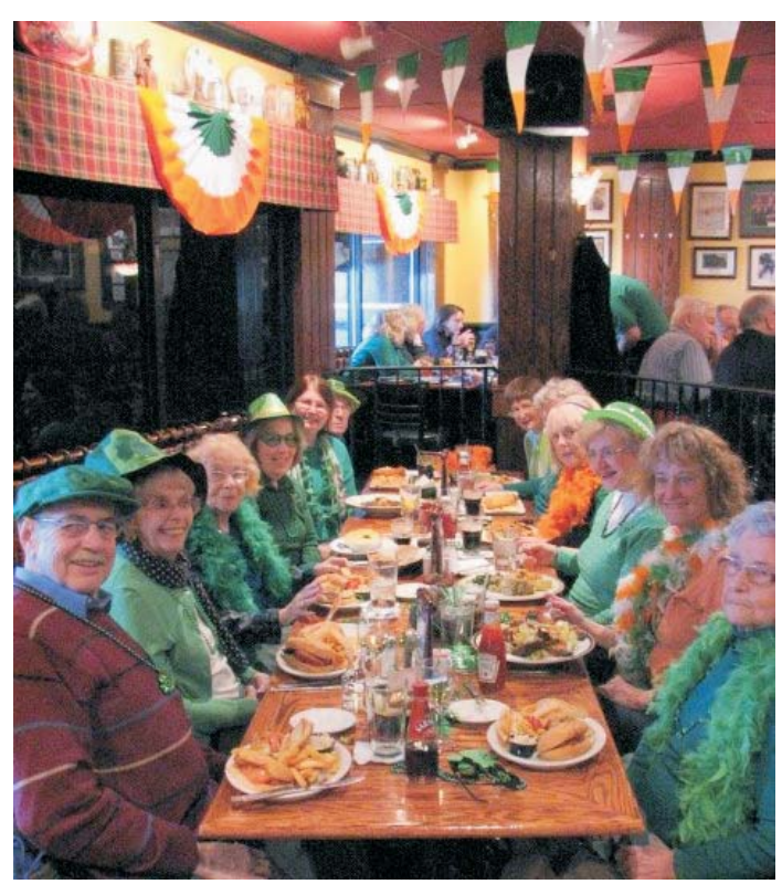
Gourmands celebrate 10 years of dining out with a festive St. Patrick's Day luncheon.