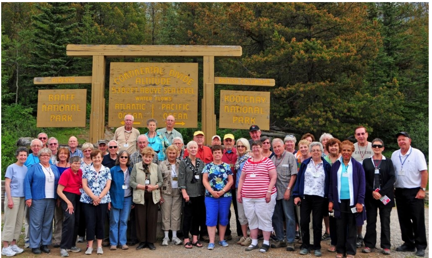
LLI members at the Continental Divide on the Northwest National Parks Tour.