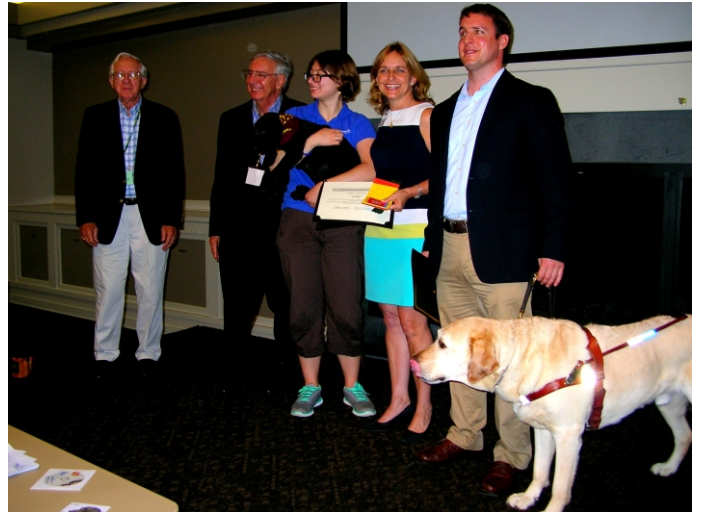
"Guiding Eyes for the Blind" members shared their inspiring mission and wonderful dogs with LLI at the September Forum.