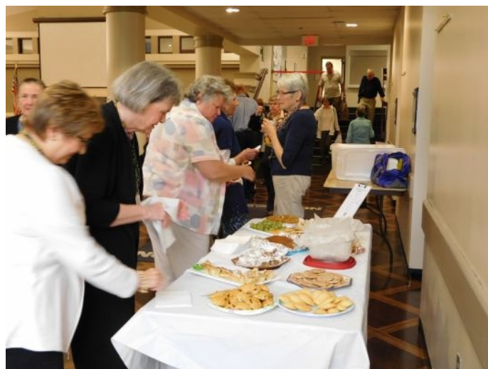
Hospitality Table at the most recent Forum.