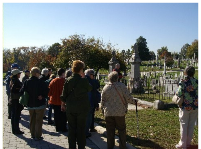
Congressional Cemetery, November 3, 2015.