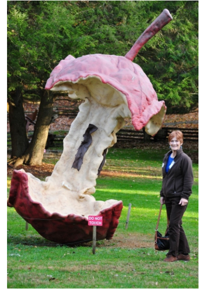
Apple, Kentuck Knob