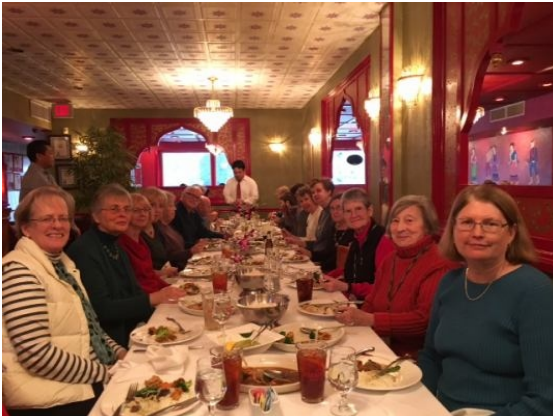
Gourmands, January 15, 2016 — Lunch at Duangrats Thai restaurant in Falls Church, Virginia.