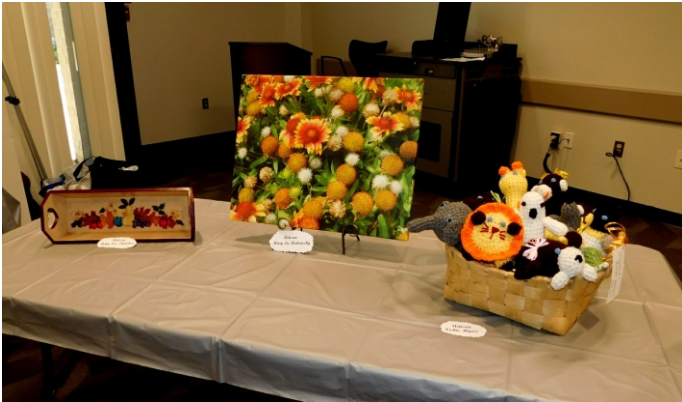
These photos are just a sampling from the Art and Craft Exhibit — see more on the LLI website.