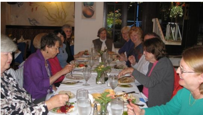
Gourmands at Taverna Cretkou, Old Town Alexandria.

Answer to "Just for Fun": In all of the words listed, if you take the first letter, place it at the end of the word, and then spell the word backwards, it will be the same word. Did you figure it out?