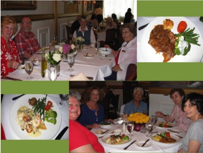
Gourmands at Café Renaissance ...