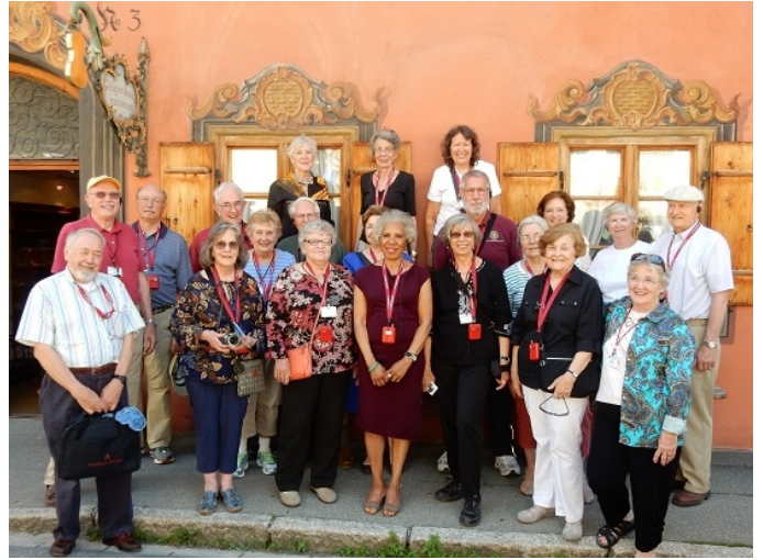
Romantic Villages of Alpine Europe