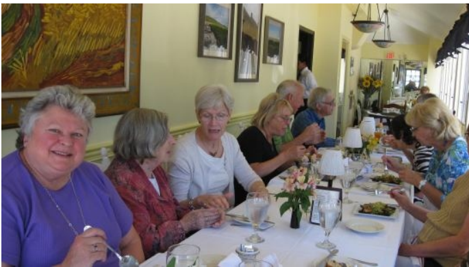
... and at the Café d'Or