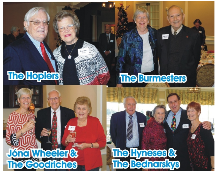
Members enjoying the Holiday Party.