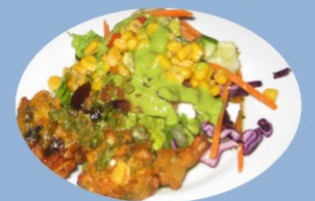
Gourmands at Bamian Restaurant on January 18.