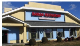
Falls Church 1-18-17