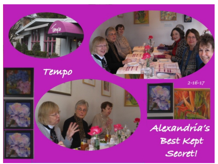
LLI Gourmands enjoying lunch at Tempo in Alexandria, VA.