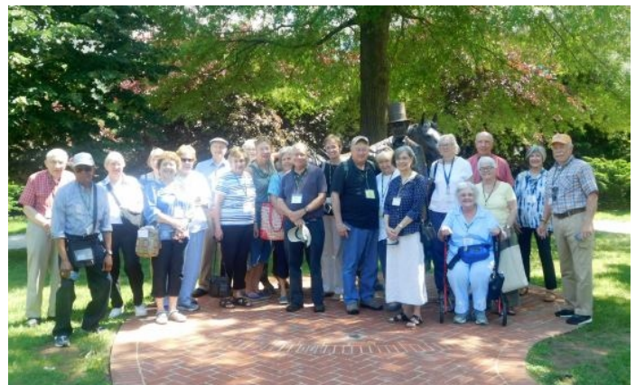
Lincoln Cottage Day Trip in June. Abe is wearing the black top hat.