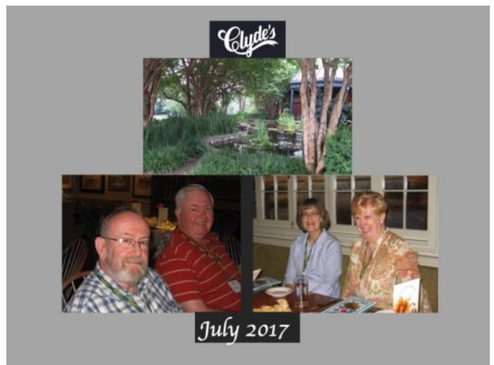
LLI Gourmands lunched at Yayla Bistro, Arlington in June and Clydes, Alexandria, in July.