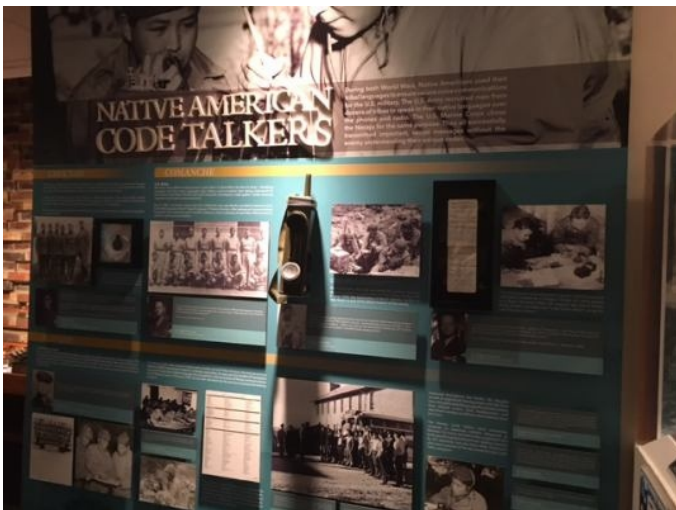
The National Cryptologic Museum was a July Day Trip.