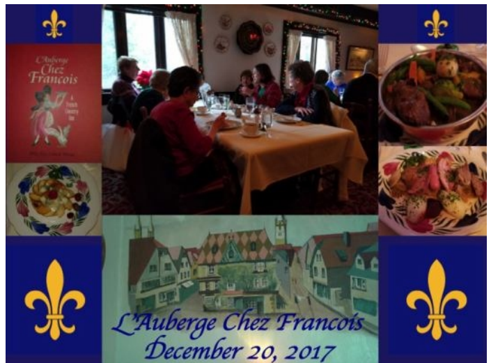
Gourmands enjoying the Holiday Spirit and wonderful cuisine.