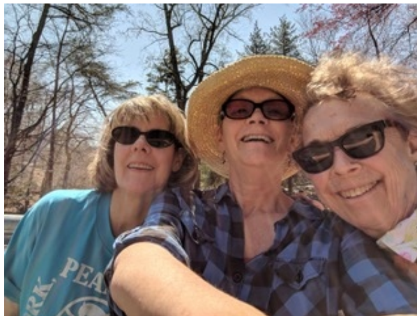
Group of smiling "Walkaboutsers."

July 13. Rutherford Park: 4798 Guinea Road, Fairfax. Cross Streets: Between Bayard Place and Braeburn Drive. The park is on the left coming from Braddock Road (we'll cross Guinea Drive, walking east).