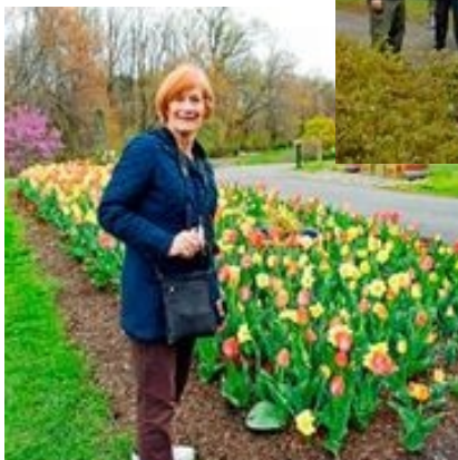
LLI members enjoying an informative stroll through Meadowlark Park.