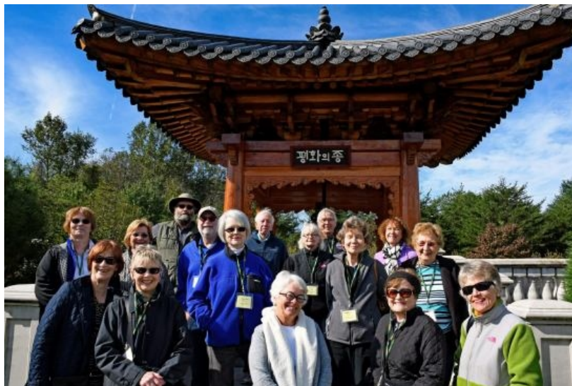
LLI members enjoying a Fall walking at Meadowlark Botanical Gardens.