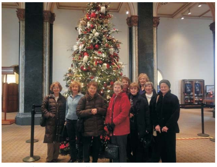
LLI members at Freer Gallery, Washington, D.C.