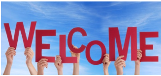
Bing Free Image