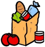
Bing Free Image