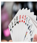
Bing Free Image