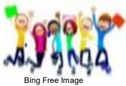
Bing Free Image