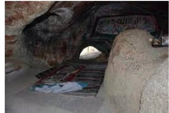
Cave of Hira