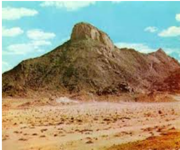
Mountain of Light (Jabal Noor)