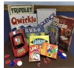
Bing Free Image

The Mystery Book Club will meet Jan. 6, 2020, at Kim Rendelson's home located at 3401 Silver Maple Place, Annandale. The group meeting will be a social gathering to plan the mysteries we will discuss in 2020. Please call Kim at 703-204-0388 if you plan to come. We will begin at 10:00 a.m.