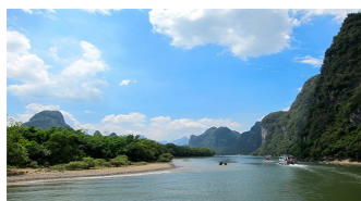
Bing Free Image

[At any time, if you have established a member ID and password, you can go to the Member Directory to search for contact information for a current member. At the website llinova.org click on the "Member Area" and then "Member Directory."]