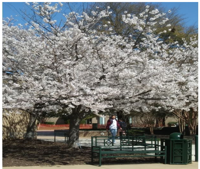
Photo on NOVA campus near Godwin Building

Please click here for more information on the Community College Initiative Program and to sign up to be a social host beginning in August 2020. Thank you for considering this opportunity.