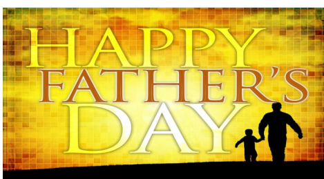
Bing Free Image