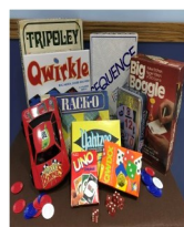
Bing Free Image

This has helped us to cope with the self-imposed quarantine. Click here for the SIG page and contact.