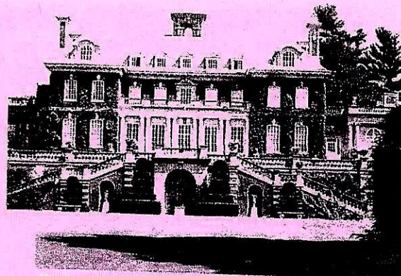
Westbury Mansion and Gardens (above)