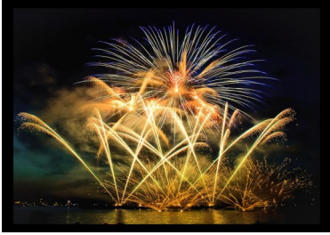
Bing Free Image