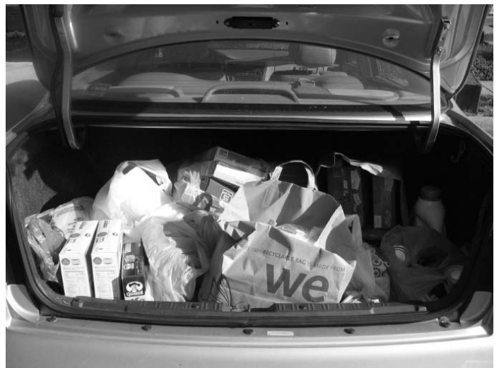
Trunk full of May donations to Koinonia