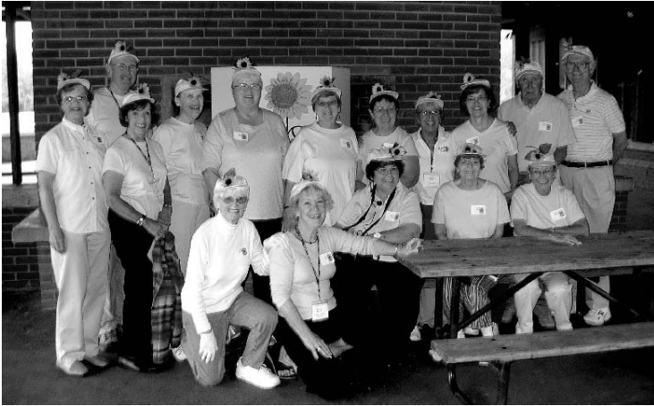
Our outstanding Picnic Committee