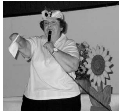
Guess Who, leading one of her original ditties