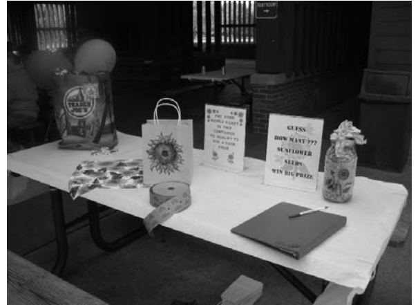
Door-prizes and games