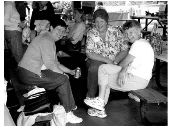
Group of happy picnickers