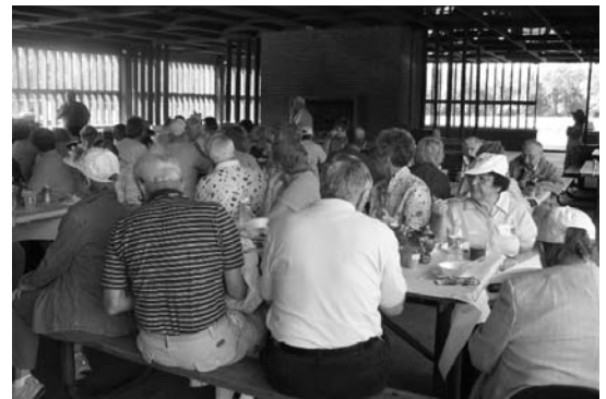
Some of the picnic crowd