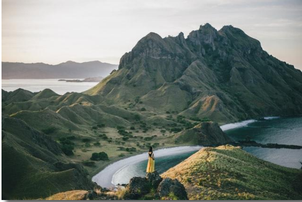
Padar Islands, East Nusa Tenggara