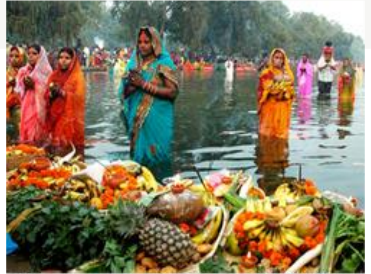
Women performing 'Chhat Puja' Rites