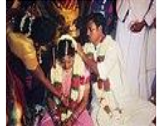
South Indian Wedding