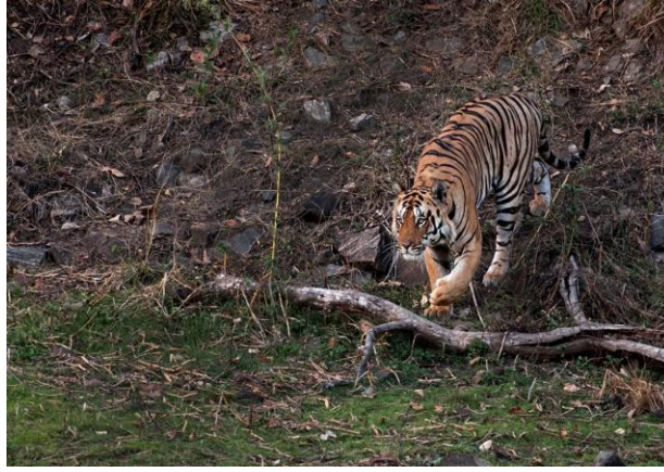
Jim Corbett National Park