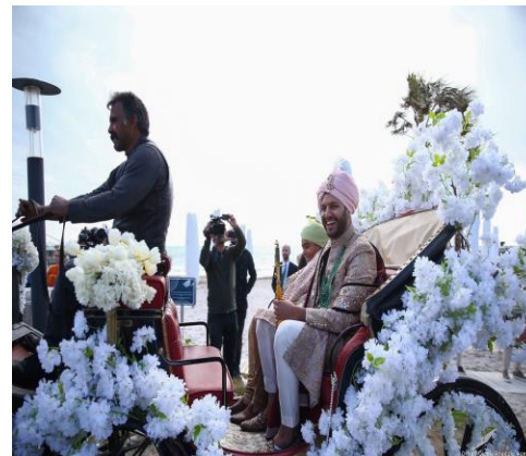
North Indian Wedding