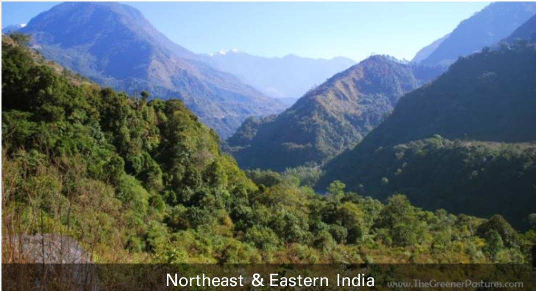
Northeast & Eastern India www.TheGreenerPastures.com