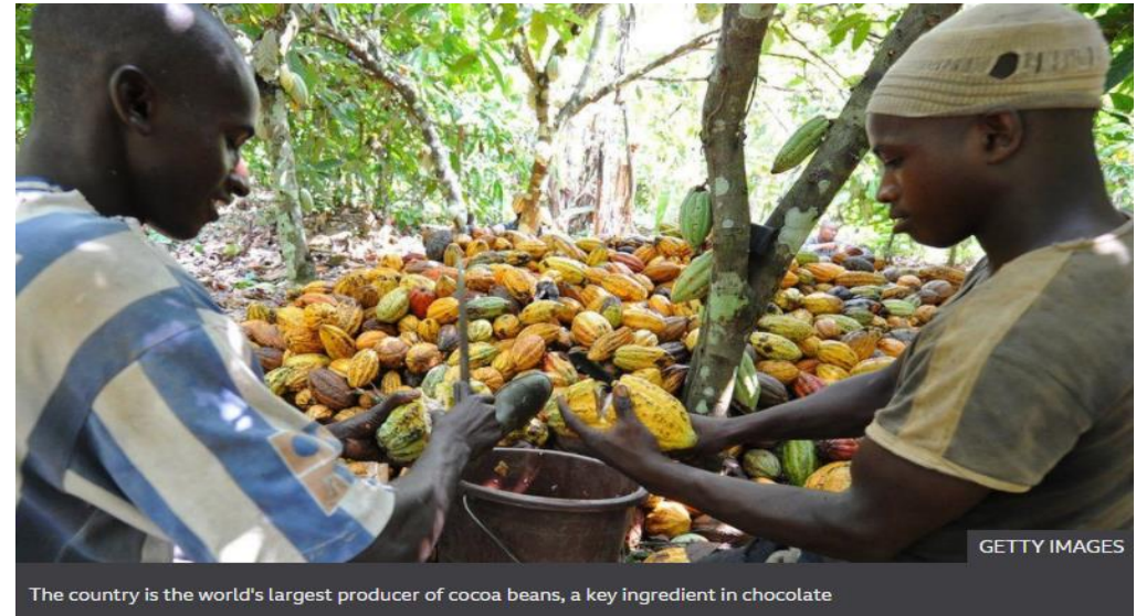
The country is the world's largest producer of cocoa beans, a key ingredient in chocolate