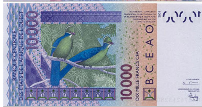
Banknote of 10,000 CFA ≈ $20

Our Currency is the West African CFA ( $1 = 549,49 FCFA )