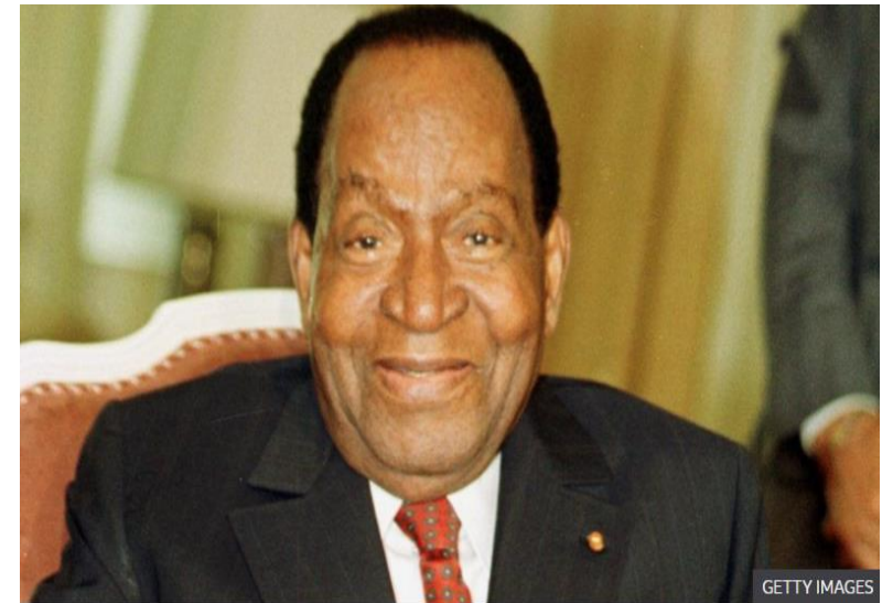
Ivory Coast was relatively stable and prospered economically under Felix Houphouët-Boigny's three decades at the helm