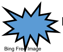
Bing Free Image

Facets 10700 Page Ave, Building B, Fairfax VA 22030 facets@facetscares.org (703) 352-5090