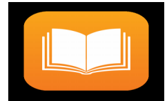
Bing Free Image

Thursday, June 17, 11:30 a.m.— 1:00 p.m. (Zoom Meeting)