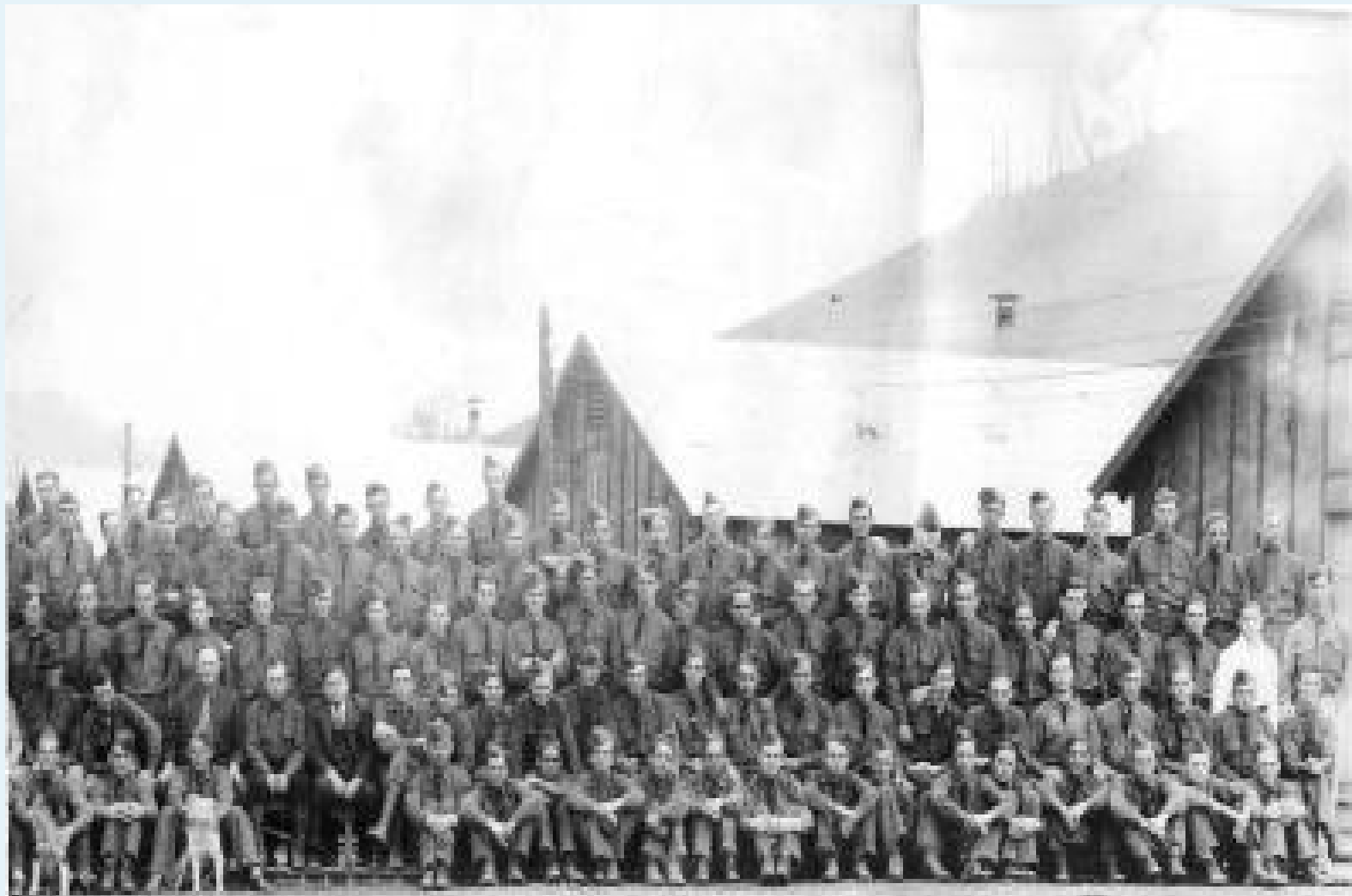
NATIONAL CONSERVATION CORPS CAMP NO. 349, CO 374 CLEVELAND, OH MARCH 21, 1935