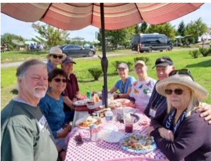
LLI members at Barrel Oak Winery

Would you like to join a lively group of LLI/NOVA members who talk about the fascinating and frustrating world of finance and investments? Whether you are a neophyte looking for some answers or Warren Buffett's