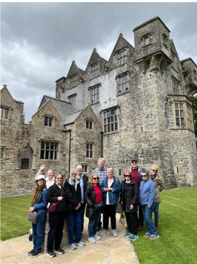
Our LLI group at Donegal Castle in Ulster

Here are a few pictures from our recent Jewels of Ireland tour. More will be posted online soon.