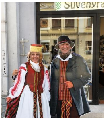
Kaunas (Lithuania) Castle in native garb

We then proceeded to Kaunas and to Vilnius, Lithuania's capitol.